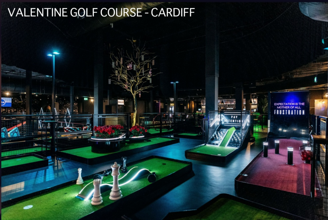
VALENTINE GOLF COURSE - CARDIFF