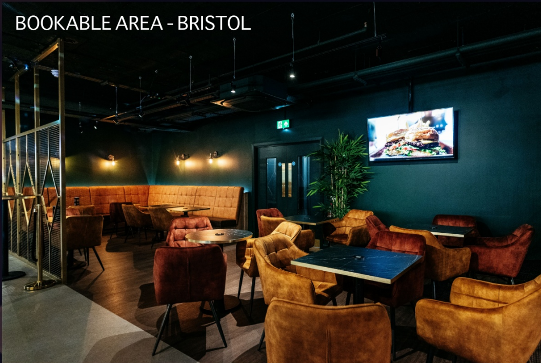
BOOKABLE AREA - BRISTOL