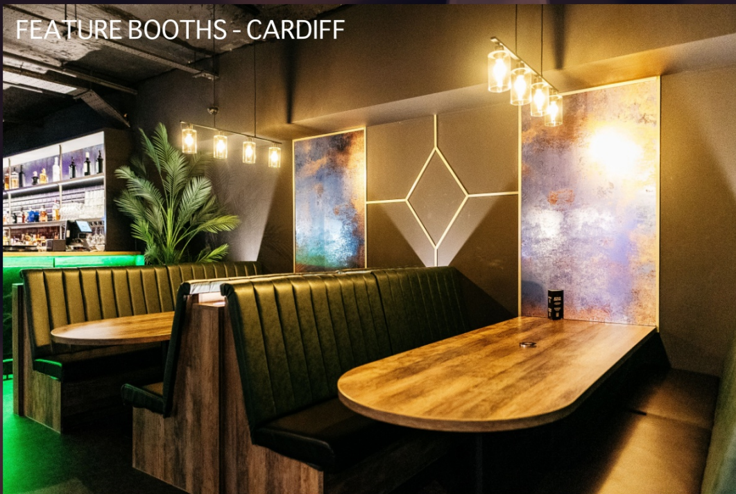
FEATURE BOOTHS - CARDIFF