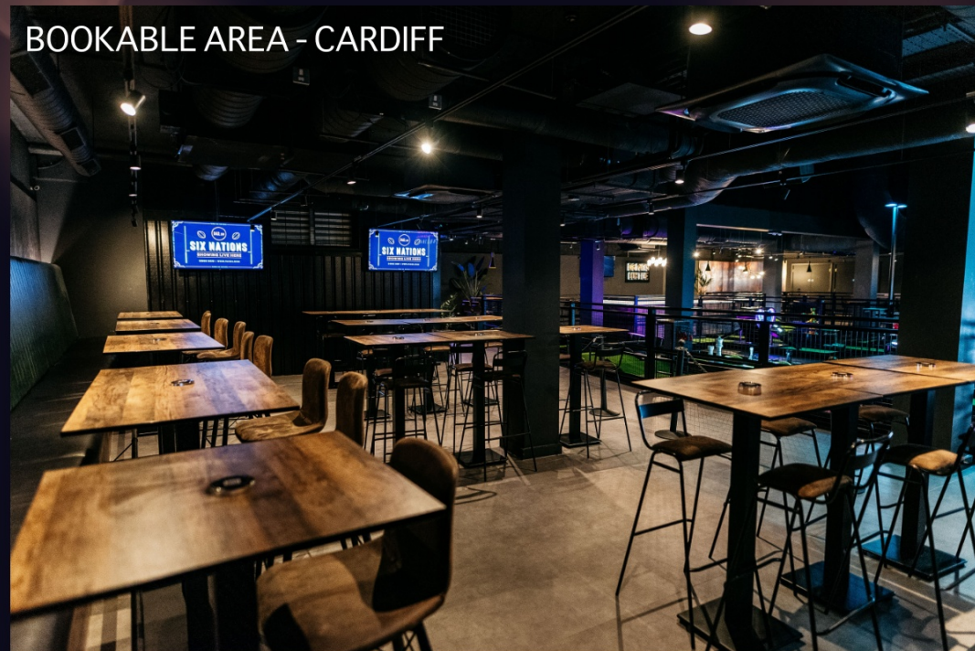
BOOKABLE AREA - CARDIFF