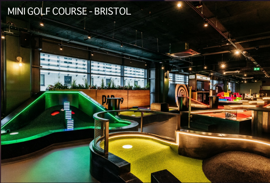
MINI GOLF COURSE - BRISTOL